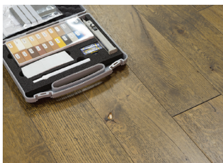
CHIPS, DEEP DENTS