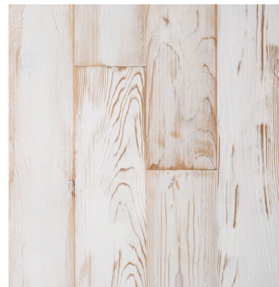
White Distressed Spruce Panelling

White Distressed Spruce Engineered T&G panelling by Forté. 17mm thick, 150mm wide and 1000/1200/2200mm lengths. Glue and pin installation method onto substrate. Pre-finished with water-based paint