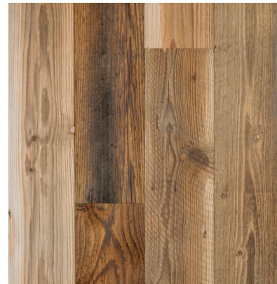
Natural Spruce Panelling

Salvare Natural Spruce Engineered T&G panelling by Forté. 17mm thick, 150mm wide and 1000/1200/2200mm lengths. Glue and pin installation method onto substrate. Unfinished.