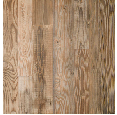
Natural Spruce Lamella

Salvare Natural Spruce Lamella by Forté. 7mm thick, mixed width and length. Glue and pin installation method onto substrate. Butt joint profile. Unfinished.