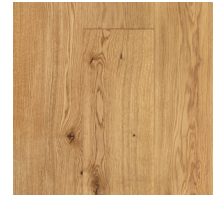
Sorrento Light Feature