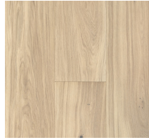
Capri Light Feature