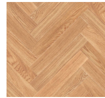
Sorrento Light Feature