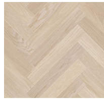
Capri Light Feature