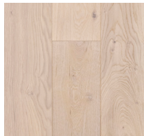
Blond Oak Feature