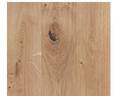
Natural Oak Feature